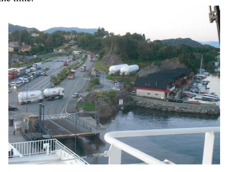
Dedicated 500 m<sup>3</sup> LNG storage tanks at ferry terminal in Halhjem, Norway

Team members were able to observe the transfer of LNG from a road truck to the two 500 m<sup>3</sup> dedicated shore storage tanks at the Halhjem ferry terminal. It was note worthy that these tanks were located only a few feet behind a resort marina. Transfer was accomplished during normal daytime hours. They were also able to observe the bunkering of the MV Raunefjord from these tanks later that night. Bunkering was undertaken at night so that no vehicles or passengers would be onboard at the time.