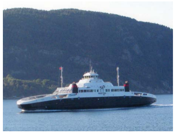
Single fuel LNG ferry MV Fanafjord, sister ship of the MV Raunefjord, underway