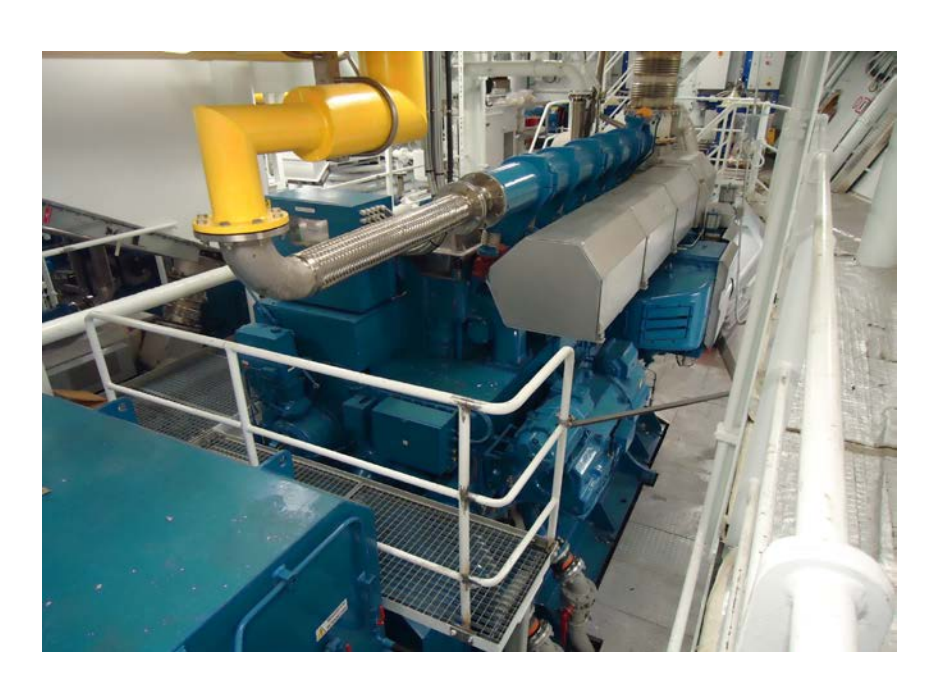
Wärtsilä dual fuel 6L34DF generator set onboard the PSV Viking Princess with double-walled gas supply line in yellow