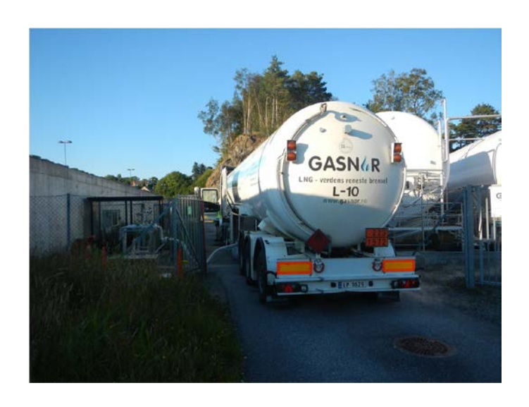
Resupply of LNG storage tanks from a road truck

The steam conversion project team members were also able to tour the propulsion plant of the nearly completed Eidesvik Platform Supply Vessel Viking Princess in the Kleven Verft shipyard. The vessel was christened by the Crown Princess of Norway in Bergen September 14, 2012, five weeks after the visit, and is now supplying platforms in the North Sea. The vessel is 89.6 m long with an integrated electric plant supplied by two Wärtsilä dual fuel 6L34DF generator sets and two smaller Wärtsilä dual fuel 6L20DF generator sets. These four generators produce a total output of 7332 ekW. The vessel already had LNG onboard and was operating one of its smaller dual fuel generators on MDO for shipboard power at the time of the visit. The ship is equipped with two rotating dual propeller thrusters aft and two bow thrusters and an azimuthing thruster forward for use in dynamic positioning. The MV Viking Princess was built using the Det Norske Veritas inherently safe engine room design concept since these engines have double-wall piping all the way the cylinder heads.